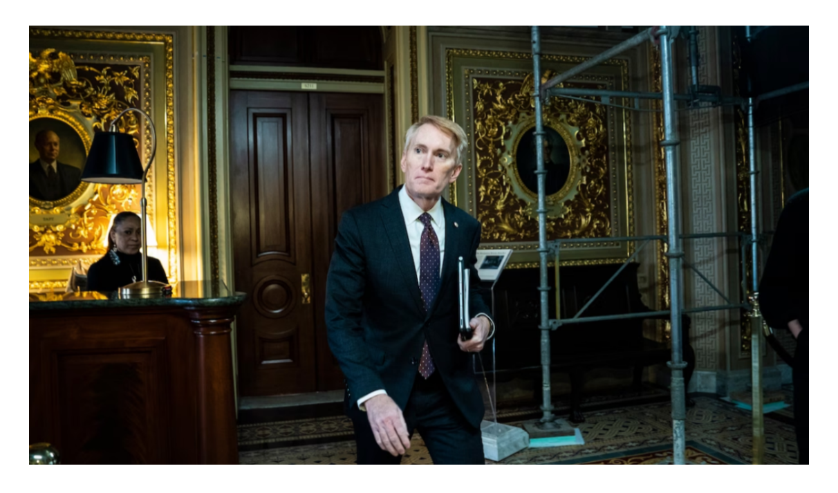
Route Fifty | Border deal dies in the U.S. Senate, despite pleas from mayors — State and local leaders called for Congress to pass the proposal, but Republican Senators acknowledged it did not have enough support after House Speaker Mike Johnson declared it "DEAD on arrival."...