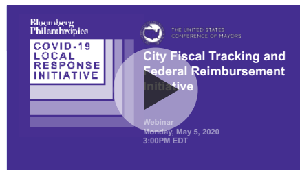
Webinar #4: FEMA Reimbursements October 22, 2020