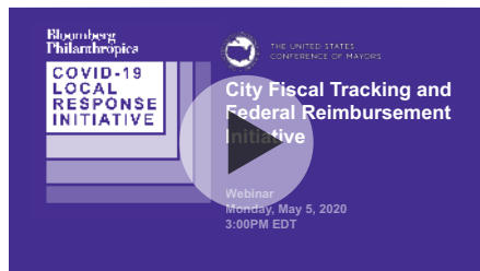
Webinar #3: CDBG Funds June 16, 2020