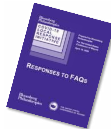
Responses to FAQs

https://www.usmayors.org/issues/covid-19/city-fiscal-tracking-and-reimbursement/