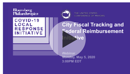
Webinar #2: FEMA Officials May 4, 2020