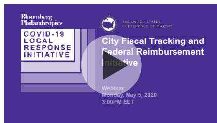
Webinar #1: Recovery Experts April 7, 2020