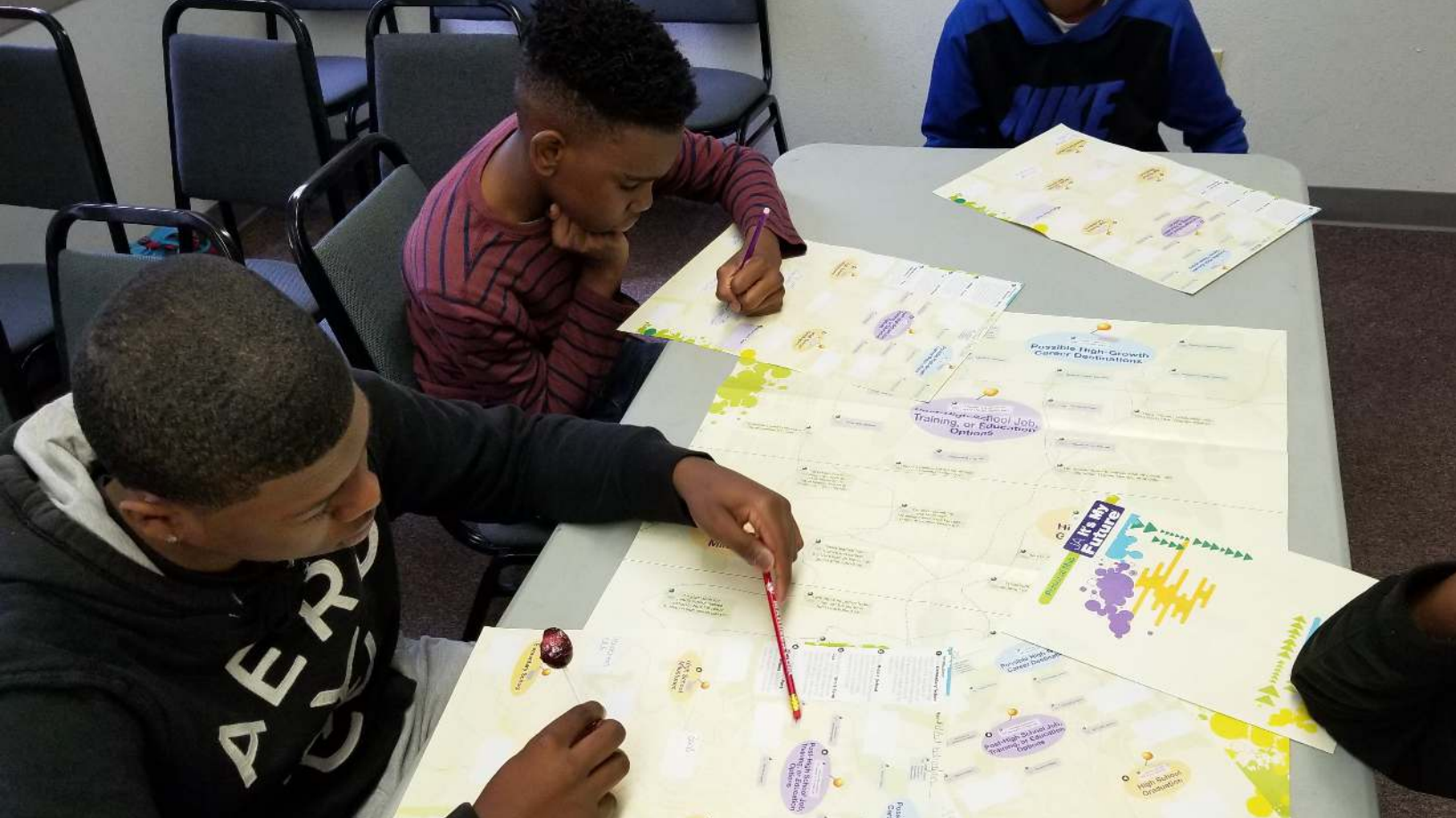
Participants in Little Rock's Junior Achievement Program