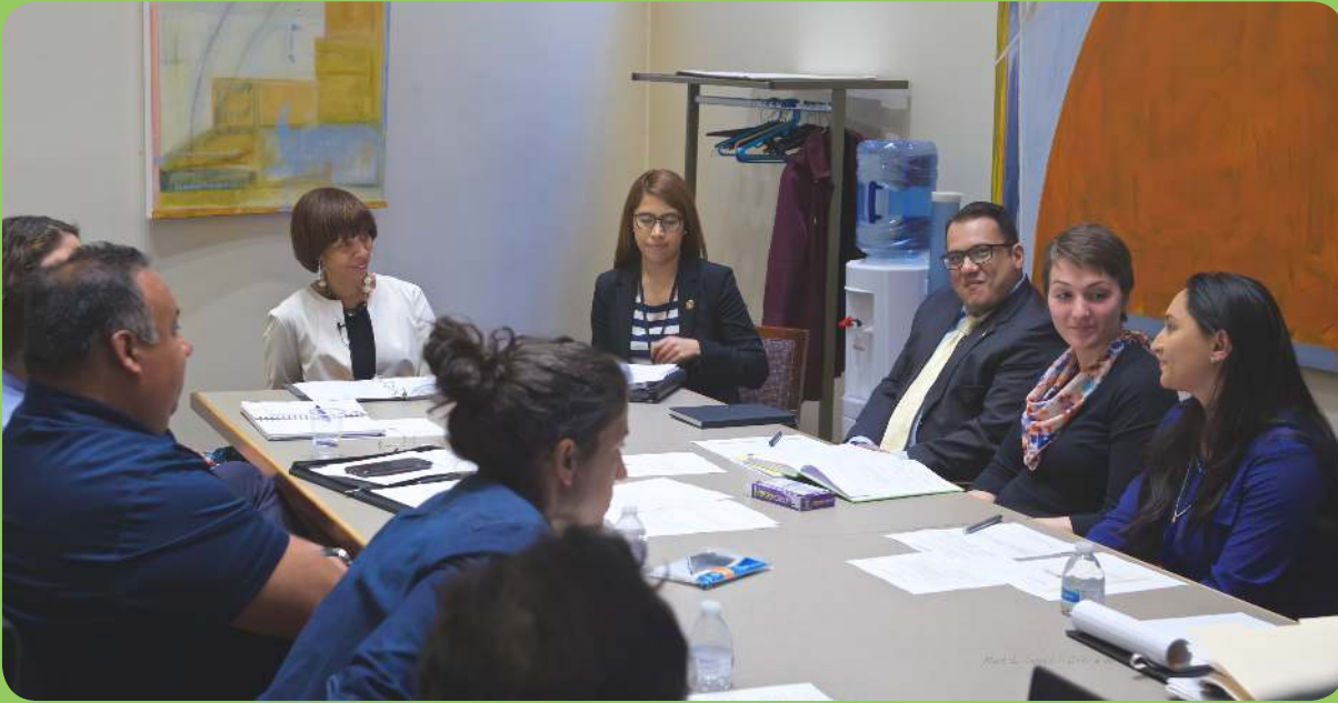
Baltimore Mayor Catherine Pugh meets with appointed members of the Baltimore City Hispanic Commission to address key issues facing Baltimore's immigrant communities