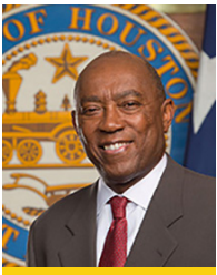
Mayor Sylvester Turner

"So many of our citizens encounter difficulties securing employment for varied reasons - whether it be a lack of education, poverty, mental health issues, or prior criminal history. Whatever the reason, we want to ensure that they have an opportunity to tap into the myriad of resources that our wonderful city offers. Turnaround Houston is a job readiness initiative. It provides our hard to employ citizens with a "one stop shop" of opportunities that can lead to them having a better future." - Houston Mayor Sylvester Turner