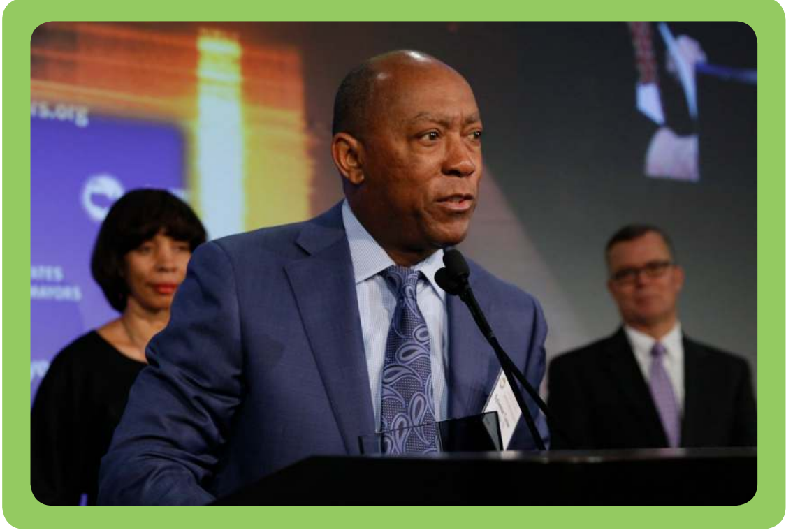
Houston Mayor Sylvester Turner discusses the importance of financial education in Prisoner Re-Entry while accepting a 2018 DollarWise Innovation Grant at the U.S. Conference of Mayors 86th Winter Meeting in Washington, D.C.

Program participants will learn how to set financial goals for their businesses, while establishing one, two and five year financial forecasts that assist the entrepreneurs in preparing a budget for startup costs, understanding cash flow, as well as how to plan for the unexpected. Upon completion of the TEP Program, each participant who graduates will receive a $300 start-up stipend for their business. To evaluate the effectiveness of the Program, OBO will follow up with graduates on a quarterly basis to check the status of their progress, and to determine whether additional support is needed. OBO will also measure program effectiveness by evaluating the number of participants from each TEP cohort with businesses that are still in operation six months to one year after completion of the program.