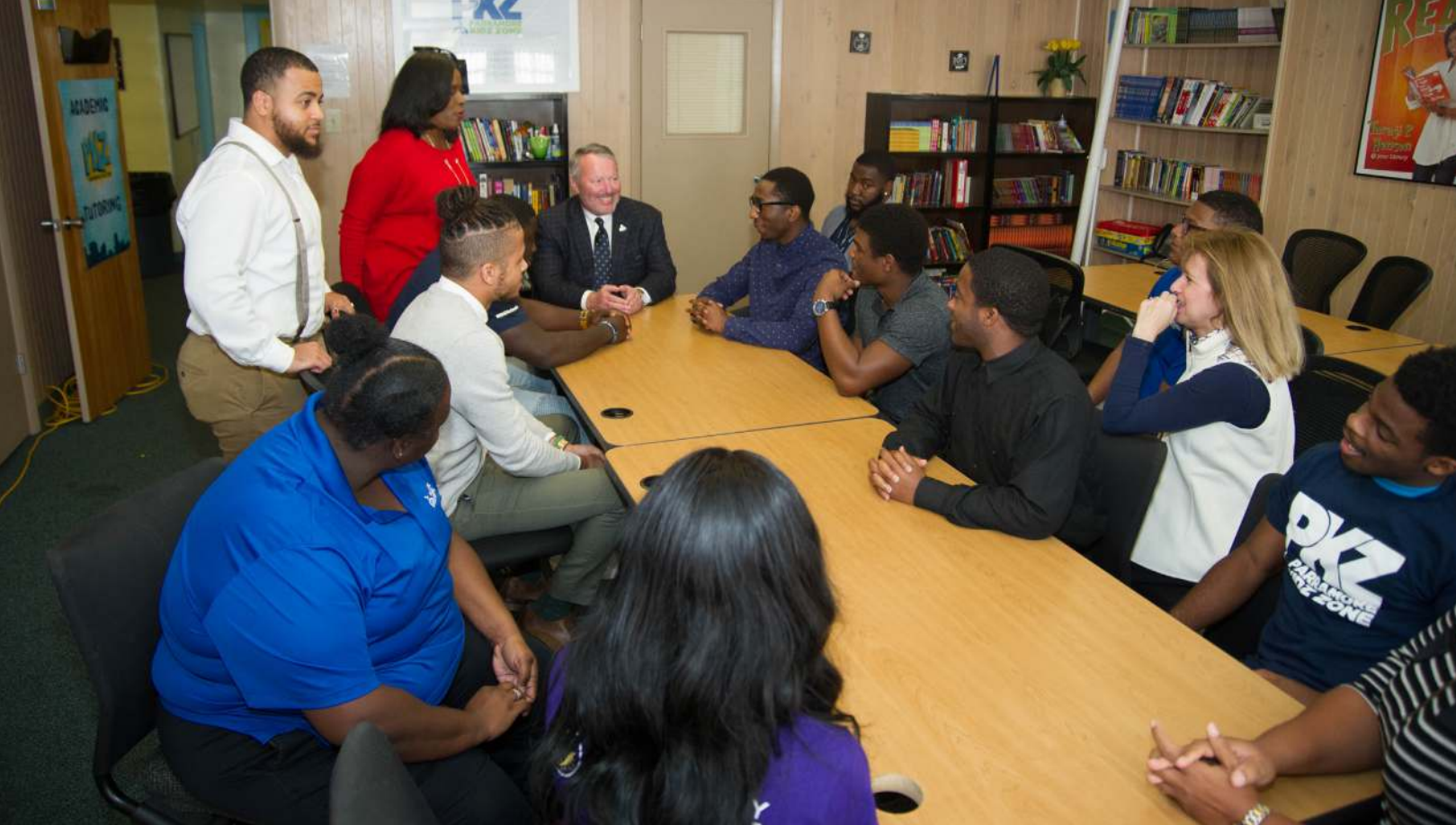
Orlando Mayor Buddy Dyer visits participants involved in Orlando's Parramore Kidz Zone Youth Employment Program