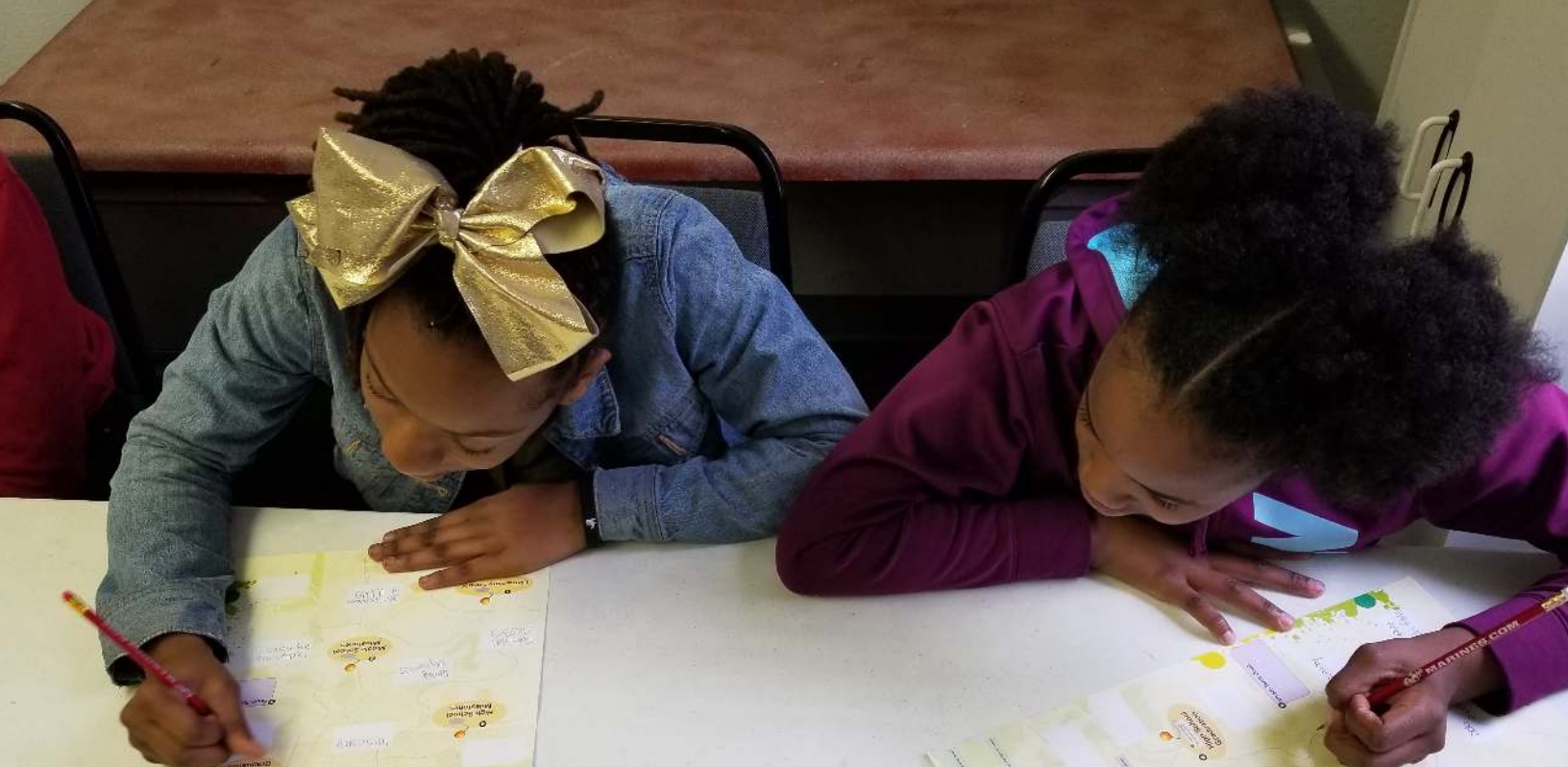
Participants in Little Rock's Junior Achievement Program