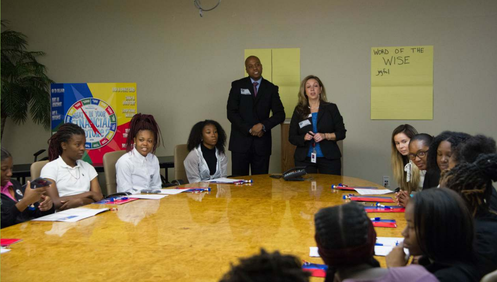
Youth involved in Orlando's Parramore Kidz Zone Youth Employment Program