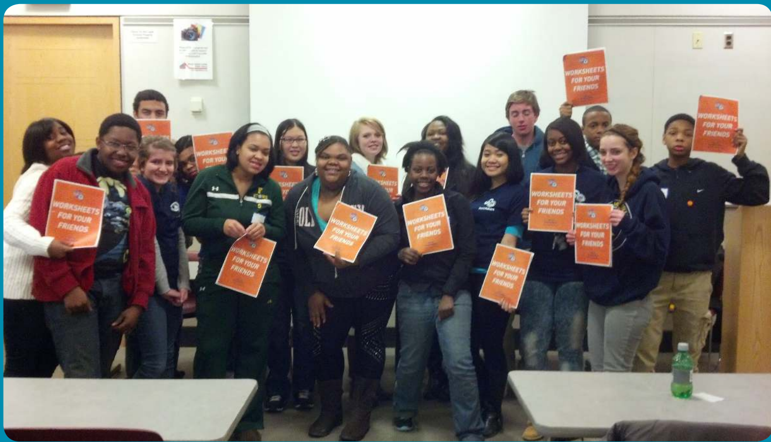
Akron PeaceMakers participate in a “Teens and Money” workshop