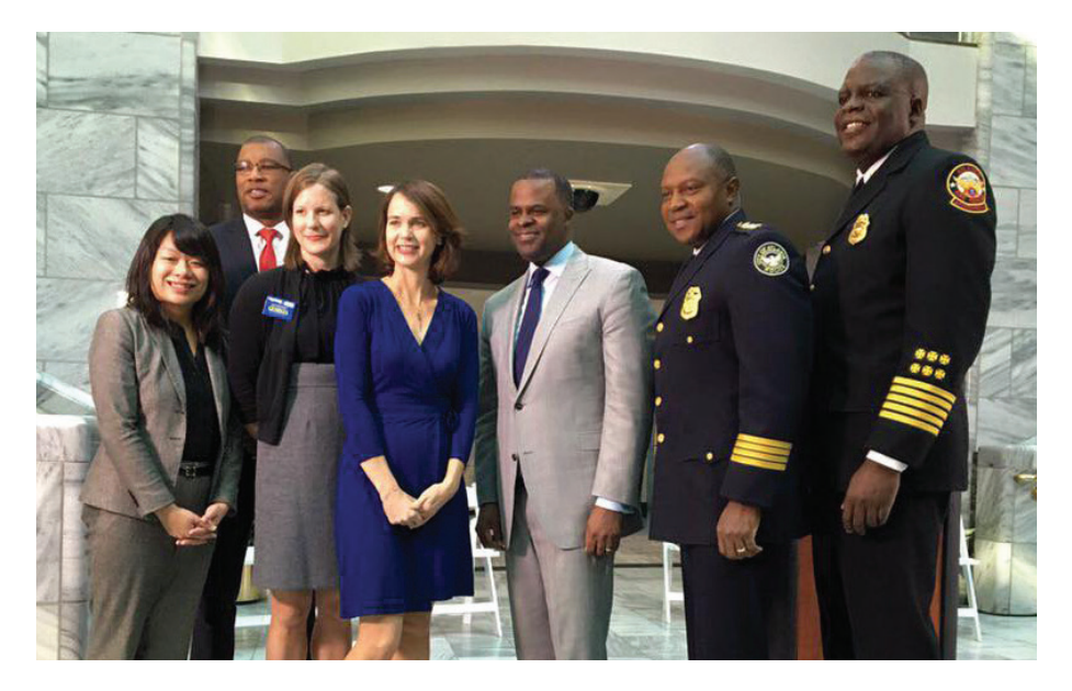
Atlanta Mayor Kasim Reed launches city's solar plan in 28 City owned buildings.

Looking to the future, we want to reduce GHG emissions from city operations and citywide by 40 percent by 2030 (2009 baseline), improve the efficiency of existing and new buildings in energy and water usage, and increase materials diversion rates to landfills up to 90 percent.