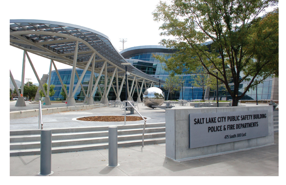
The Salt Lake City Public Safety Building is the first public safety building in the country built to achieve a net-zero energy rating through the use of on and offsite solar, efficient building design and employee engagement.