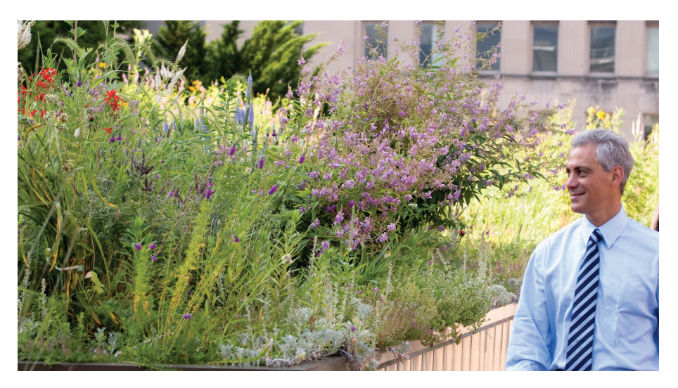
The 20,000 square foot green rooftop garden on top of Chicago's City Hall absorbs less heat from the sun than the black tar roof it replaced. The rooftop garden improves air quality, conserves energy, helps lessen the urban heat island effect and reduces stormwater runoff by absorbing and using rain water. Chicago has been a leader in green roof installations, with more than 5.5 million square feet on more than 500 rooftops.

We are in the midst of a great global migration to cities. As mayors take decisive action to build livable, competitive and sustainable cities we can shape not just the years but the decades ahead. Leadership on climate provides us an opportunity to protect future generations and help businesses and residents while creating jobs here in Chicago.