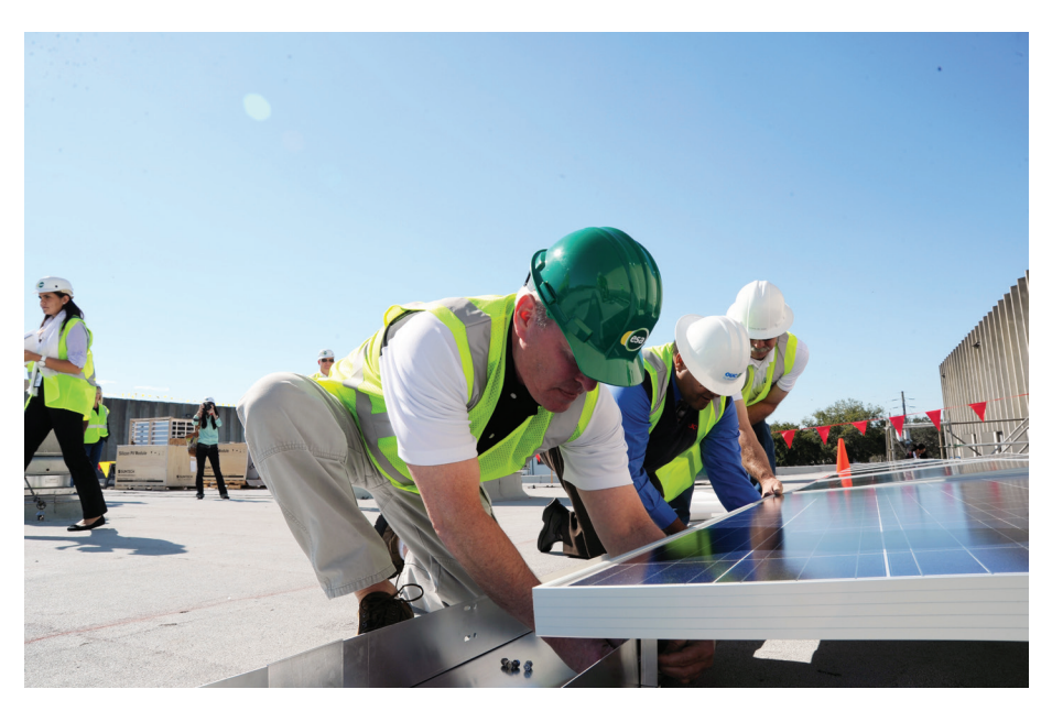
Mayor Dyer, shown in front helping to install a solar energy system, launched Green Works Orlando in 2007 to transform Orlando into one of the most environmentally-friendly, economically and socially vibrant communities in the nation.

Ultimately, our climate commitments can only be successful if we transition our electricity and our means of travel to lower carbon sources. We have the opportunity to transition from fossil fuels by better emphasizing energy efficiency and renewable energy. If done correctly, this transition will dramatically increase jobs here in Orlando. Similarly, developing more walkable and transit-oriented transportation system will not only decrease our transportation-related carbon emissions, it will also foster even greater amounts of economic development and place-making.