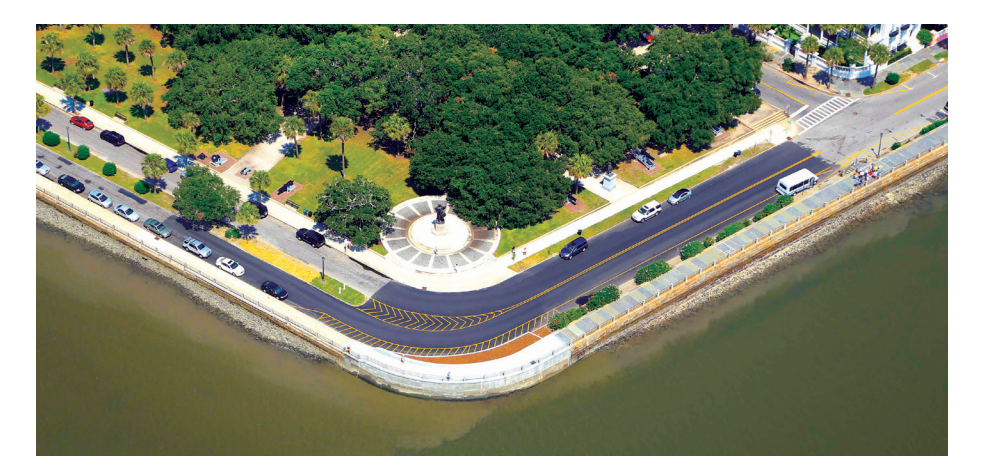
Aerial view of a sea wall in the City of Charleston.

In December of 2015, I will be sharing with City Council a strategy to support more targeted work on climate protection, particularly related to sea level rise and intense rain storms. We will recommend a planning range for anticipated sea level rise, recognizing that this must be updated as scientists prepare more accurate predictions. This recommendation will be embraced in all that our city does: plans, zoning, storm water drainage, emergency management, sustainability and so much more.