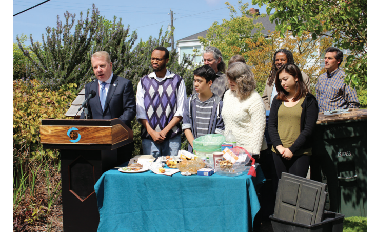
Mayor Murray, at podium, delivers remarks at an Earth Day composting event.