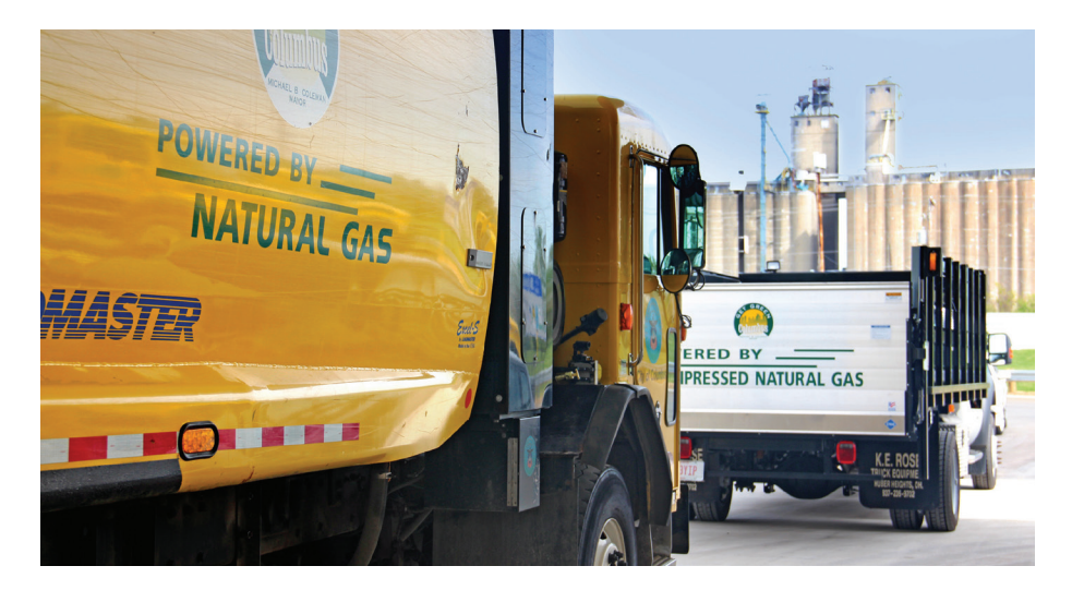
Columbus' green fleet refueling at the city's first of four CNG stations.

The science is clear, we are running out of time to be able to make a difference and change the course of our children and grandchildren's future. By 2025, I hope that we have reduced emissions by at least 40 percent. I hope that we rely less on vehicles and get a mass transit system in place. I expect that renewable energy systems will be more mainstream, existing and new buildings will be more energy efficient and our tree canopy will increase. I also hope that we are prepared. Our climate is already changing, we are seeing it on a global and local level. I expect more focus on climate preparedness and managing risks as well as planning for climate refugees.